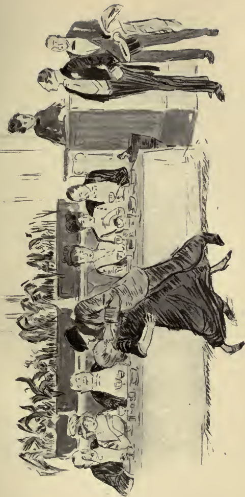
ASIDE FROM THE FACT THAT A PAIR OF PROFESSIONALS GIVE THE "APACHE" DANCE AMONG THE TABLES, THERE IS NO REASON FOR SITTING THERE. •